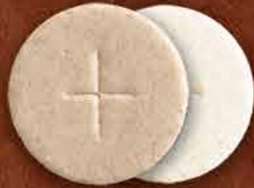
1 3/8" (35mm) Whole Wheat & White Also available with Lamb design.