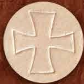
1 1/2" (38mm) Special - Whole Wheat These breads are more wheaten and have three different incised designs which have a significance for one receiving in the hand.