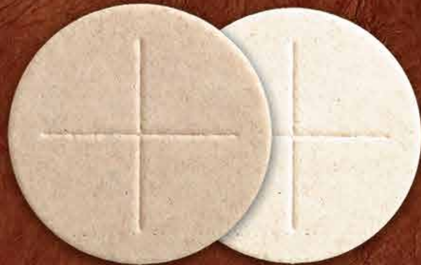
2 3/4" (70mm) Large Whole Wheat & White