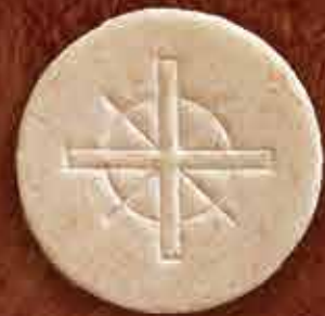
1 1/2" (38mm) - Whole Wheat