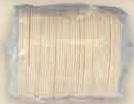
2 3/4" Large White & Whole Wheat