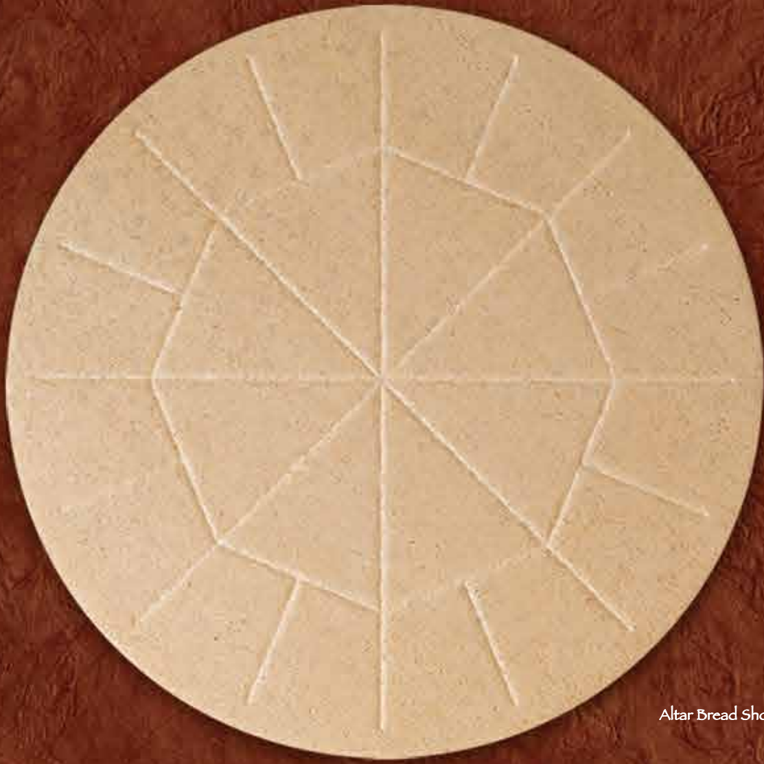
Altar Bread Shown Actual Size