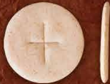
1 3/8" (35mm) - Double Thick Whole Wheat Double the thickness of most breads.