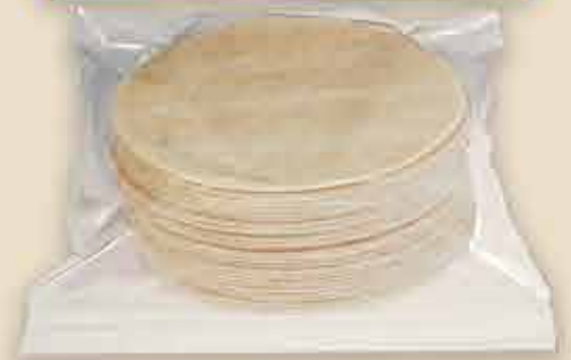
5 3/4" Whole Wheat 9" Double Thick - Whole Wheat