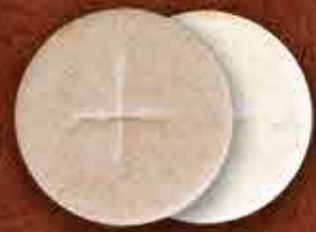
1 1/8" (29mm) Whole Wheat & White